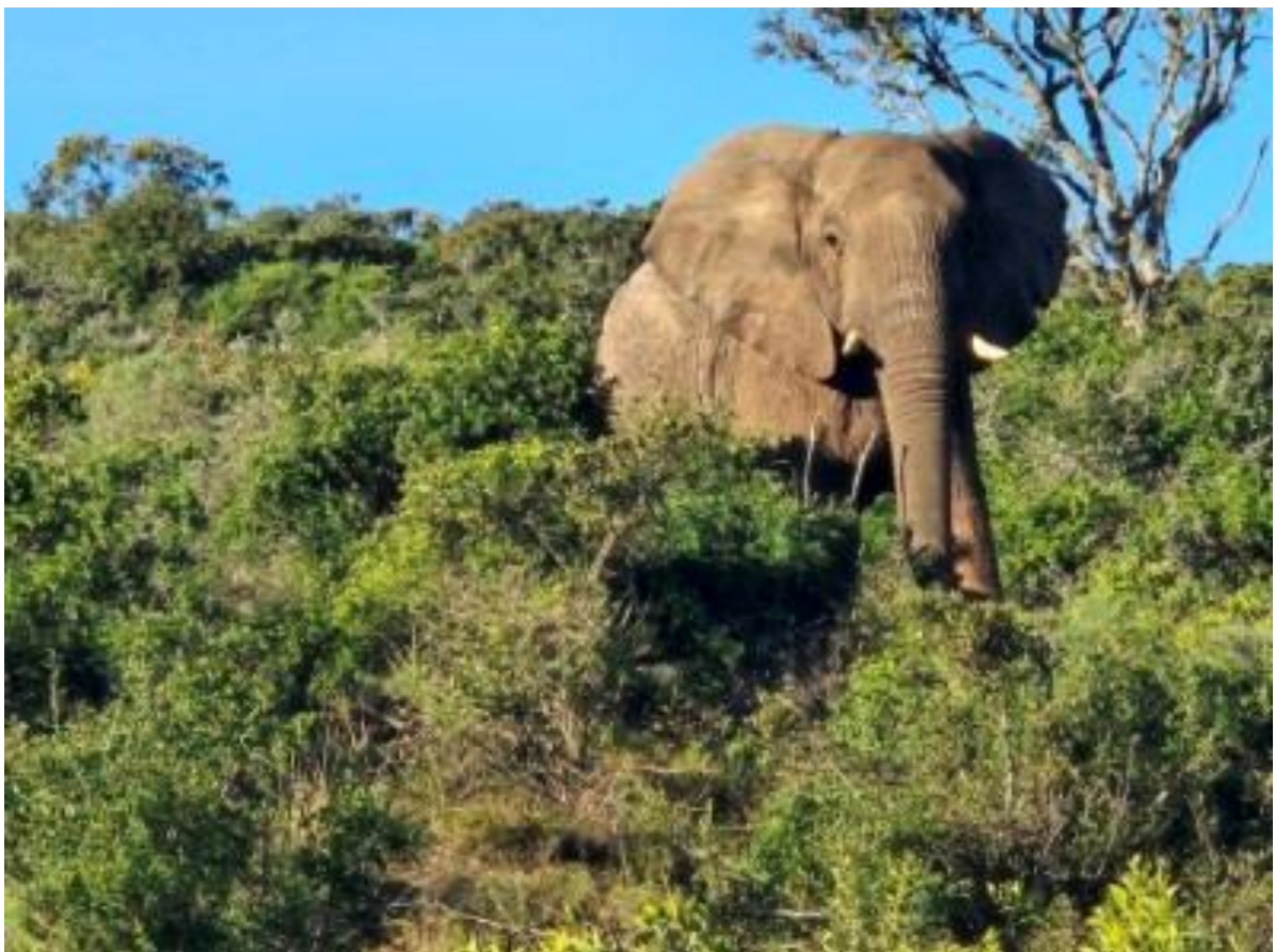
South African elephant (more photos at end of newsletter)