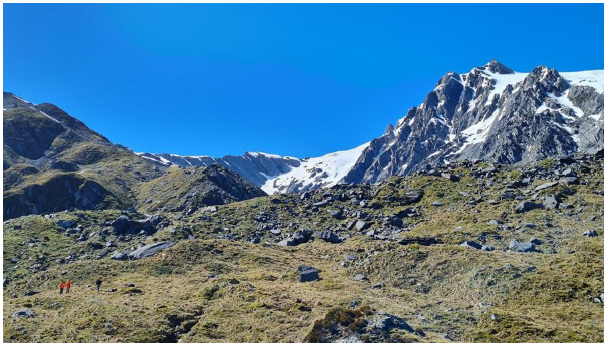
Tahr live in extreme terrain, making controlling their numbers challenging.

DOC's 2024/25 tahr control operations have wrapped up in the feral range. Just over 100 hours of aerial control was completed.