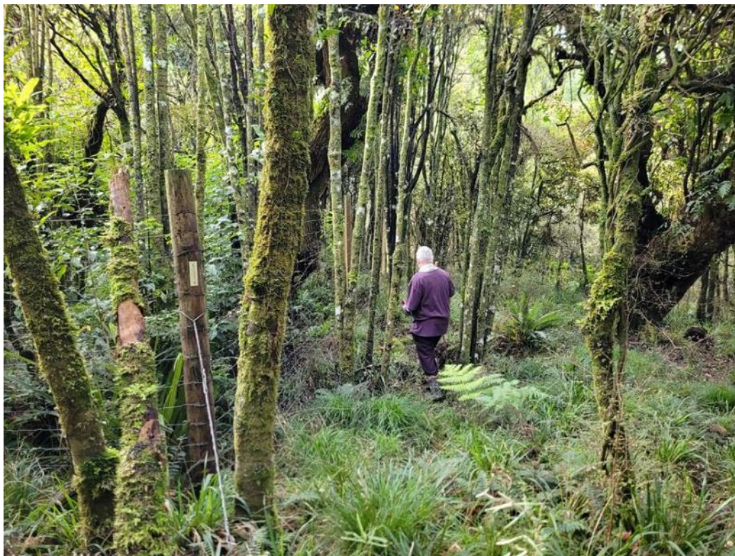
More woody saplings and broadleaf are present behind the fence - where wild deer and goats are excluded. These plants are important to our forests, they hold land together and increase resilience to the effects of climate change.

Basically, we're taking a flexible, science-based approach.