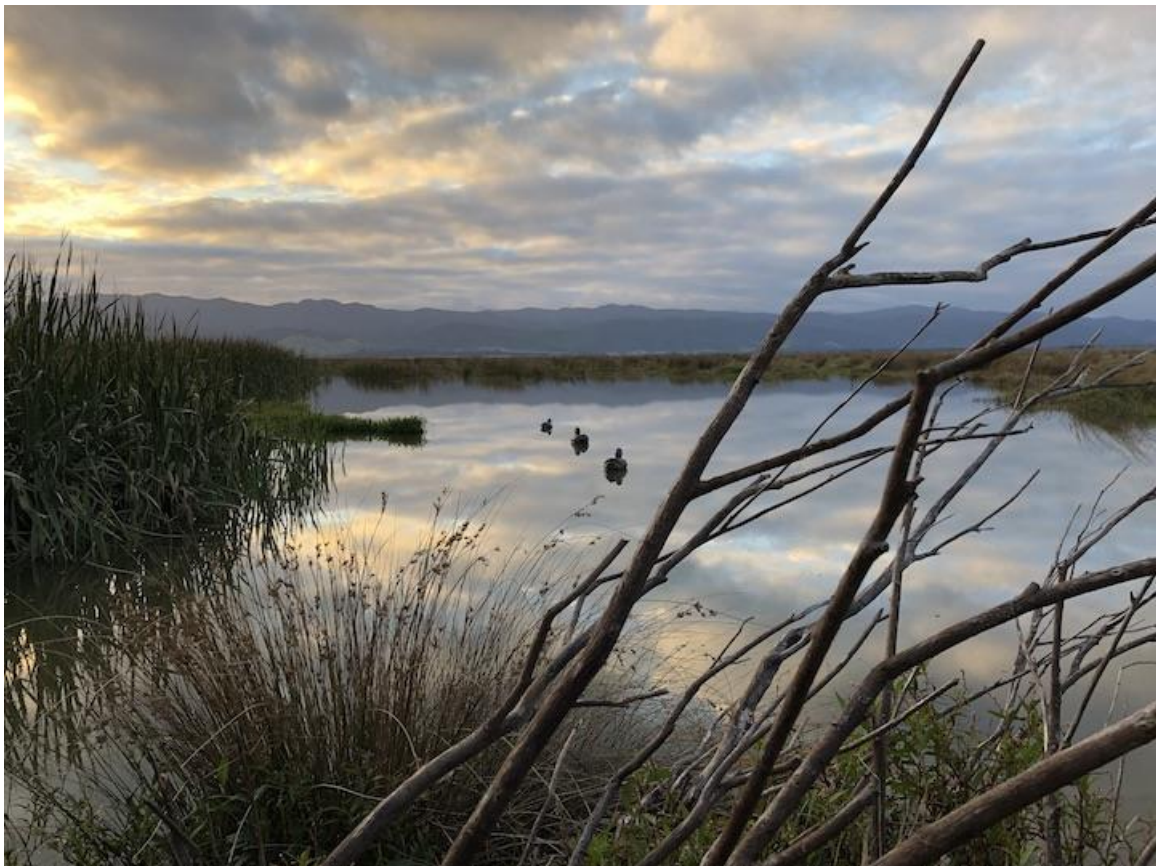
Duck season