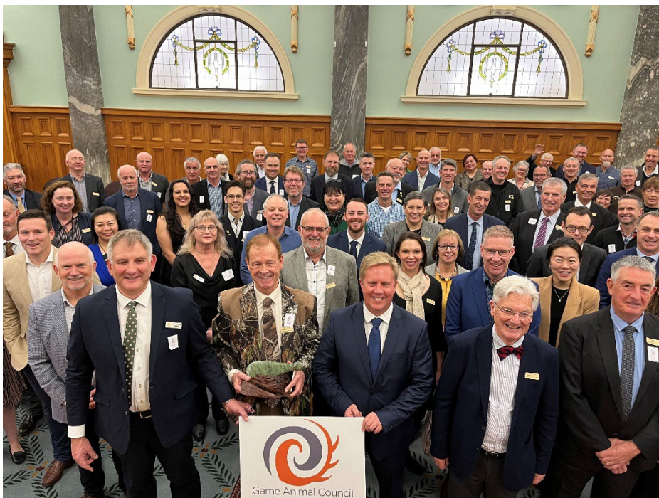
Celebrating 10 years of the NZ Game Animal Council