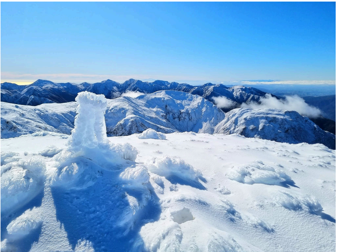
Mitre tops early August 2024