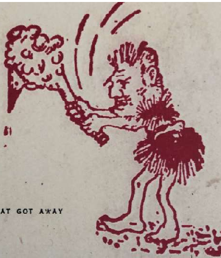
THE ONE THAT GOT AWAY