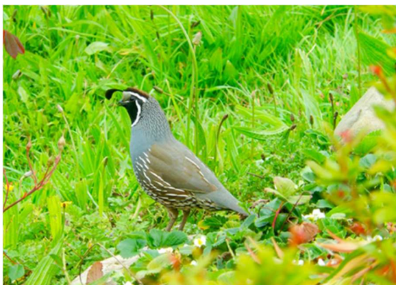
Cock quail (Peter O'Driscoll)