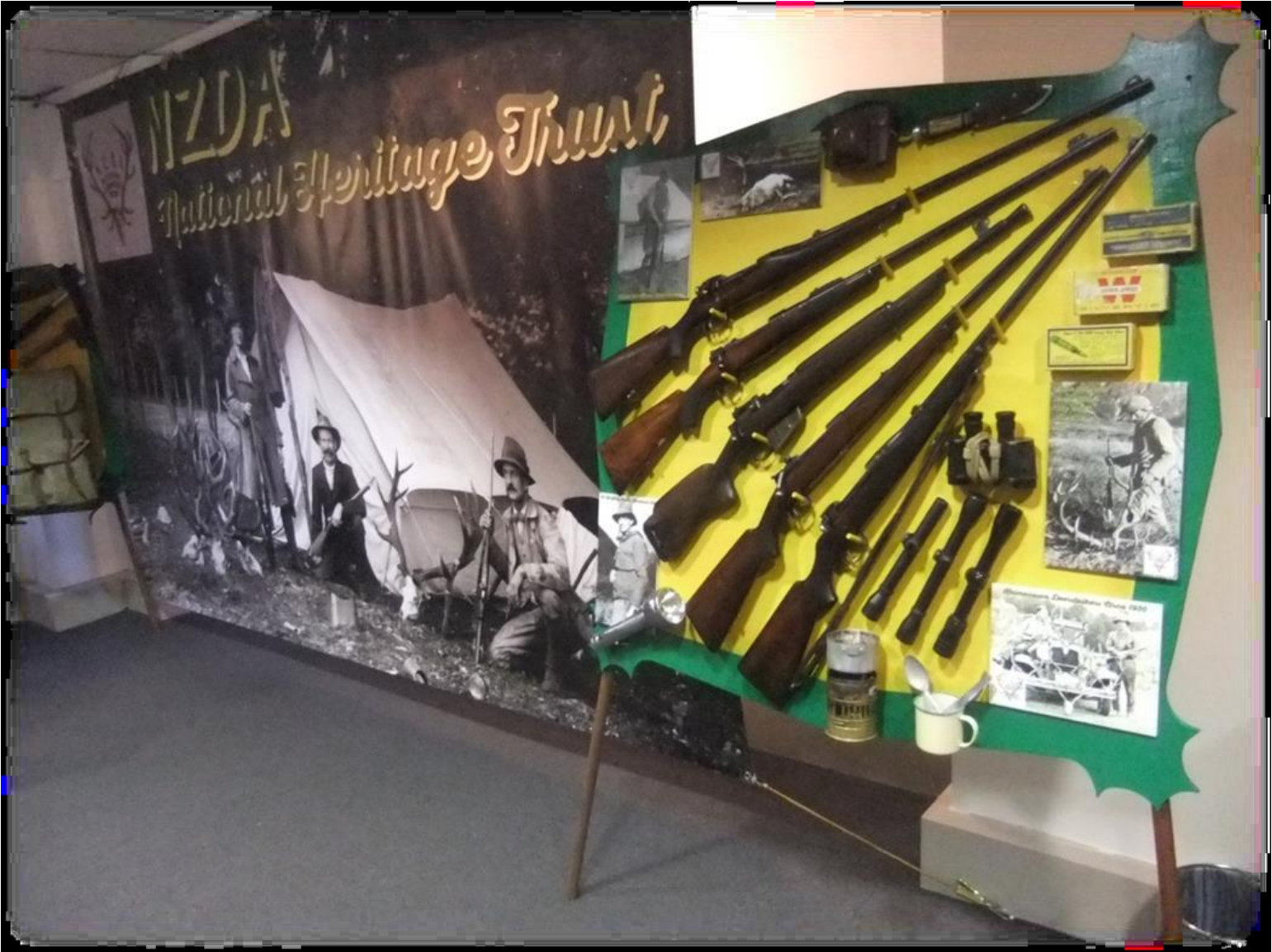
Part of the NZDA National Heritage Trust display